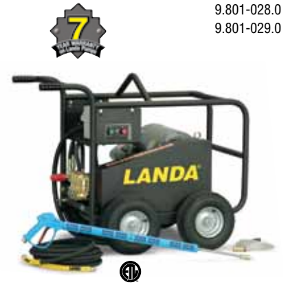
Tandem Axle Electric Powered Model: MPE5-50024B