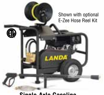
Single-Axle Gasoline Powered Model: MP-373534