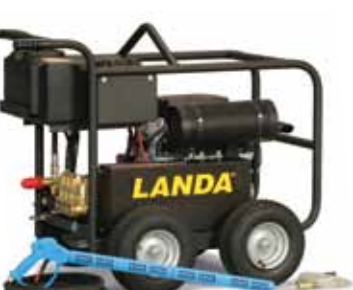
⊕ Tandem Axle Gasoline Powered Model: MP-455034E